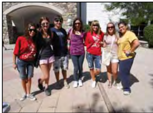
Members of Team Ramapo were among those who walked to raise playground funds.

The current playground at the Schroth Center is in need of renovation. A playground with specialized equipment, rubberized surfaces and wide ramps is needed to enable the Schroth School students to experience the therapeutic aspects and social benefits of play. The design of the new playground allows for children of all abilities the opportunity to play together. For some families a new accessible playground will afford them the opportunity to see their child enjoying a