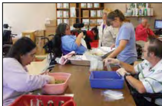
Clients in ACCESS Unlimited enjoying their new work space.

been created for Access Unlimited, our in-house supported employment workshop for adults. This component of the Agency's TEC program has returned,