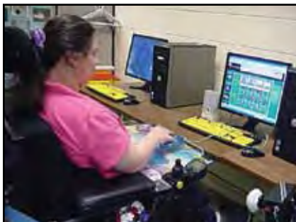
Clients benefit from adaptive computer equipment to increase literacy.