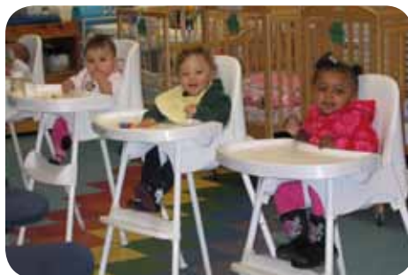
Infants pose for a picture while getting ready for lunch.