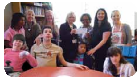
Students, clients and staff from the Schroth Center proudly display a check for $660 which they raised in their annual Empty Bowls service learning project in March. The money was then donated to Lunch Break of Red Bank.