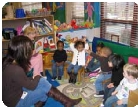
Teachers from Give-and-Take Child Care Center lead a group of children in a learning game.

The center is located at LADACIN's Schroth Center, 1701 Kneeleay Boulevard, Wanamassa (732-493-5900). Hours are Monday through Friday from 7:30 a.m. to 6:00 p.m. For more information, visit our website at www.ladacin.org or email childcare@ladacin.org .