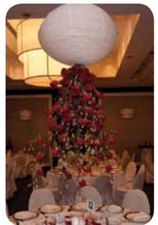
Winning Centerpiece designed by Flowers by Farrah.

and Ocean Counties donated centerpieces for the floral centerpiece contest. Gala attendees voted for the winners. Flowers by Farrah, Tinton Falls, won first place. Kirk Florist, Farmingdale, won second